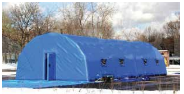
QUOTE PROVIDED ON REQUEST

The new IsoT 58 provides clean, isolated environment. It is a modular mobile unit for hospitalization of patients under isolation environment.